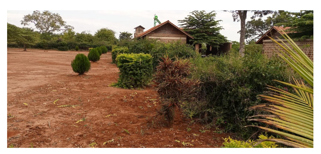
(The front view of block B residence)

Garden work has been another work which most of children love to participate as they enjoy vegetable when saved on the table. We have had session with our kids in weeding as well as harvest our garden produce. Our garden have " chiniz i" and " sukuma wiki " and all are done on the organic principles. Some species failed in the first attempt but we are on the way to redo them in June among them being tomatoes, eggplant and green peppers.